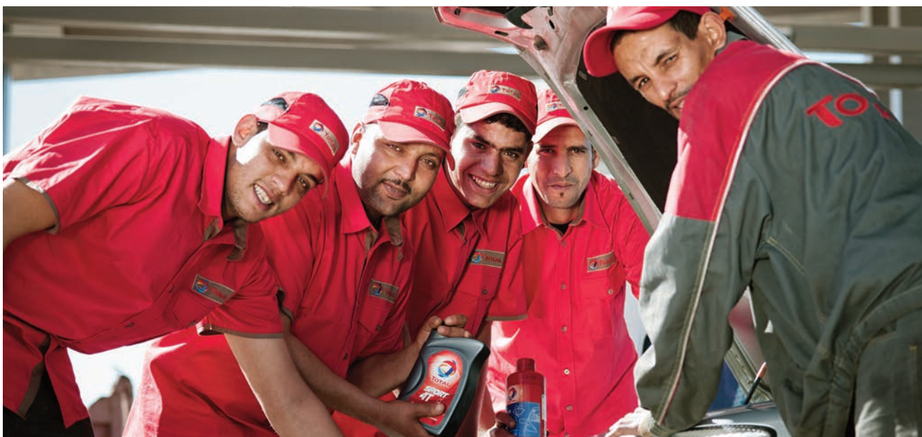
Drargua service station, Morocco.