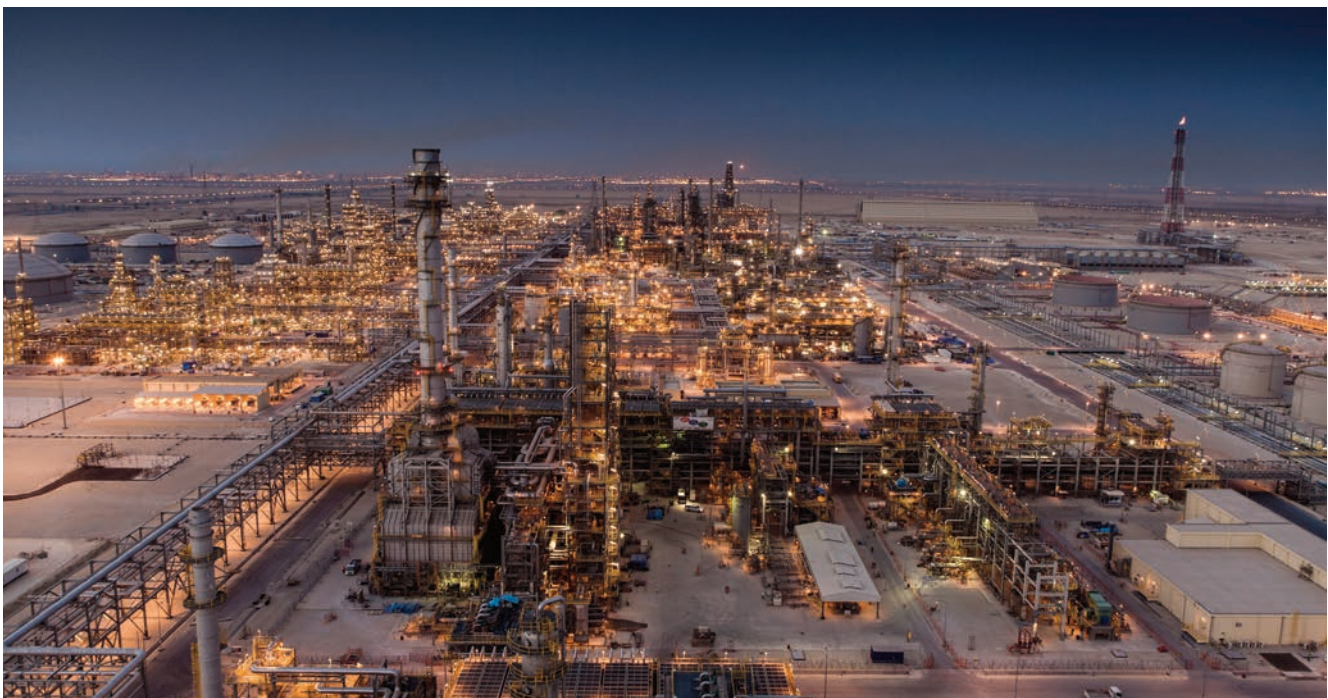
Satorp platform in Jubail, Saudi Arabia.

The following tables sum up the elements of compensation due or granted to the executive directors for the fiscal year ended December 31, 2015 by the Board of Directors, further to the proposal of the Compensation Committee, and which are presented to the Annual Shareholders' Meeting on May 24, 2016 for advisory opinion, pursuant to the recommendation made in the AFEP-MEDEF Code (point 24.3).