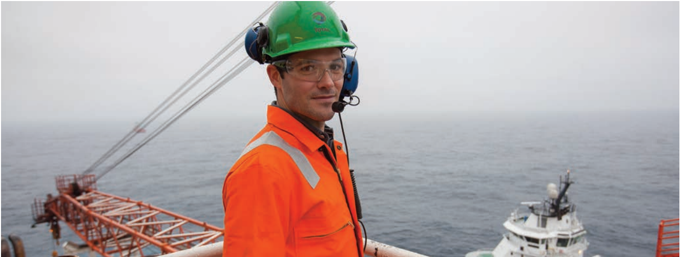
Drilling rig at Laggan-Tormore, United Kingdom.