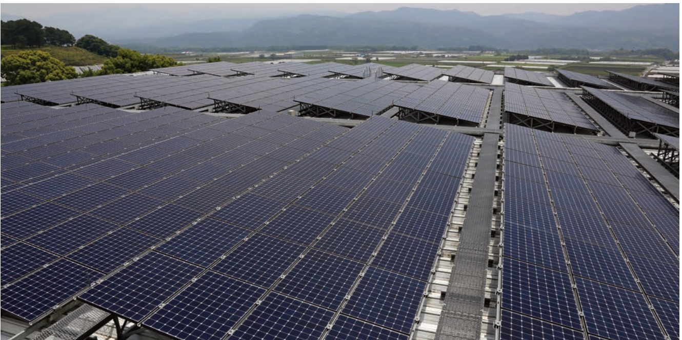
SunPower solar panels, Kumamoto, Japan.