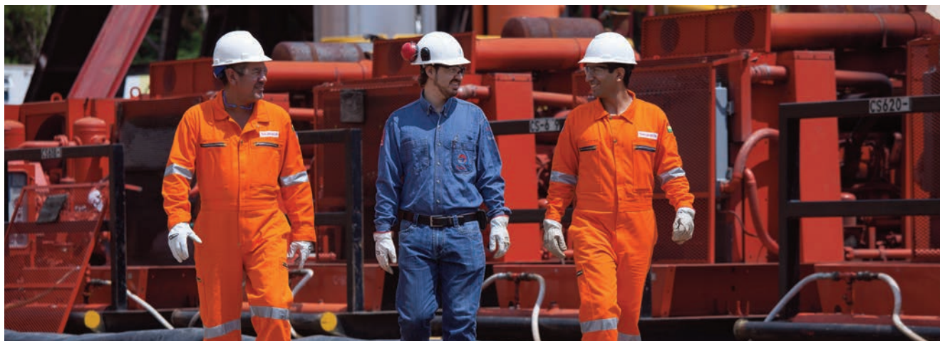
Incahuasi project, Bolivia.

2° reserve the subscription of shares to be issued to members of a company or group savings plan of the Company and the French or foreign companies affiliated with the same, within the meaning of Article L. 225-180 of the French Commercial Code and Article L. 3344-1 of the French Labor Code, in accordance with the terms and conditions provided by Article L. 3332-2 of the French Labor Code, with the specification that this resolution may be utilized for the purposes of implementing leverage formulas;