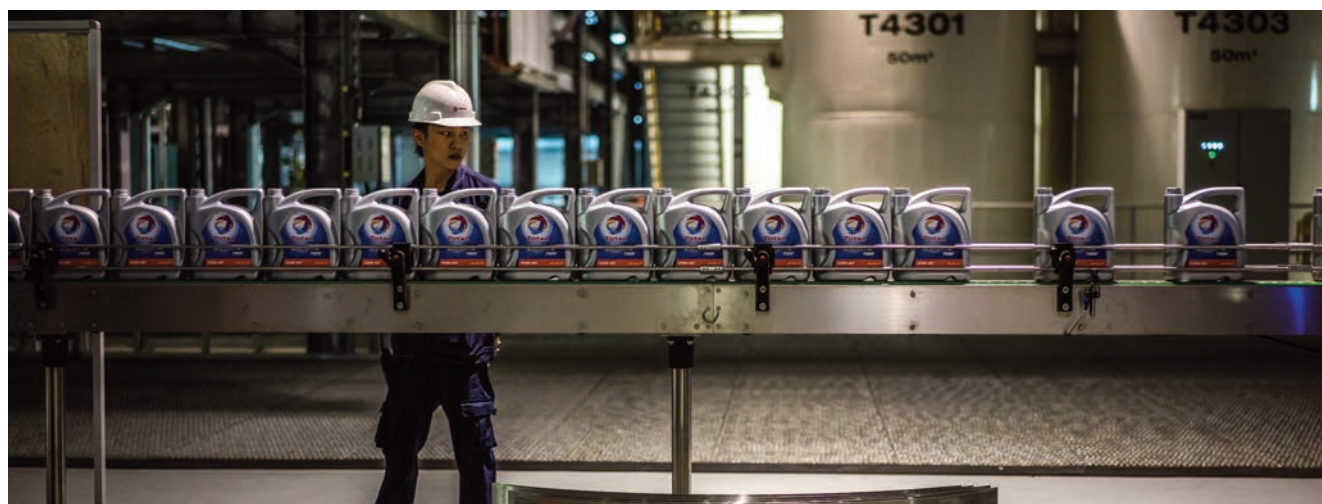
Lubricant plant, Tuas, Singapore.

1° delegate to the Board of Directors, with the option to sub-delegate within the conditions set forth by French law, the authority to decide on one or more capital increases by the issuance, in France or elsewhere, of common shares of the Company as well as any securities providing access by any means, immediately and/or in the future, to new or existing common shares of the Company; such shares or securities being issued in euros, foreign currencies or any monetary unit linked to several currencies;