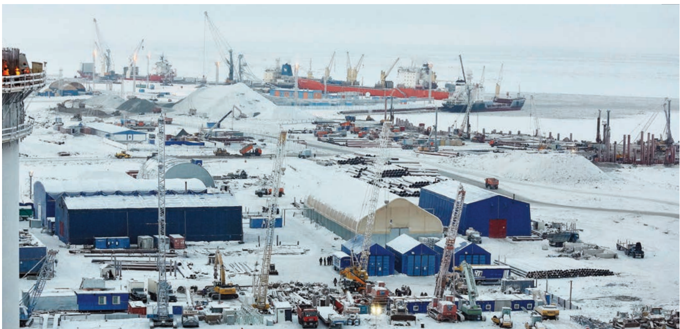
Yamal liquefied natural gas plant, Russia.

This delegation would be granted for a 26-month period from this Meeting.