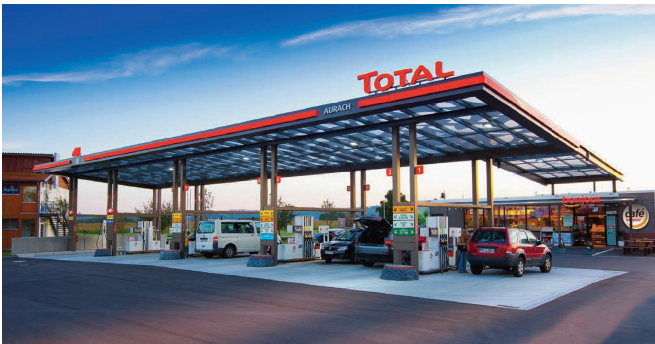
Aurach service station, Germany.