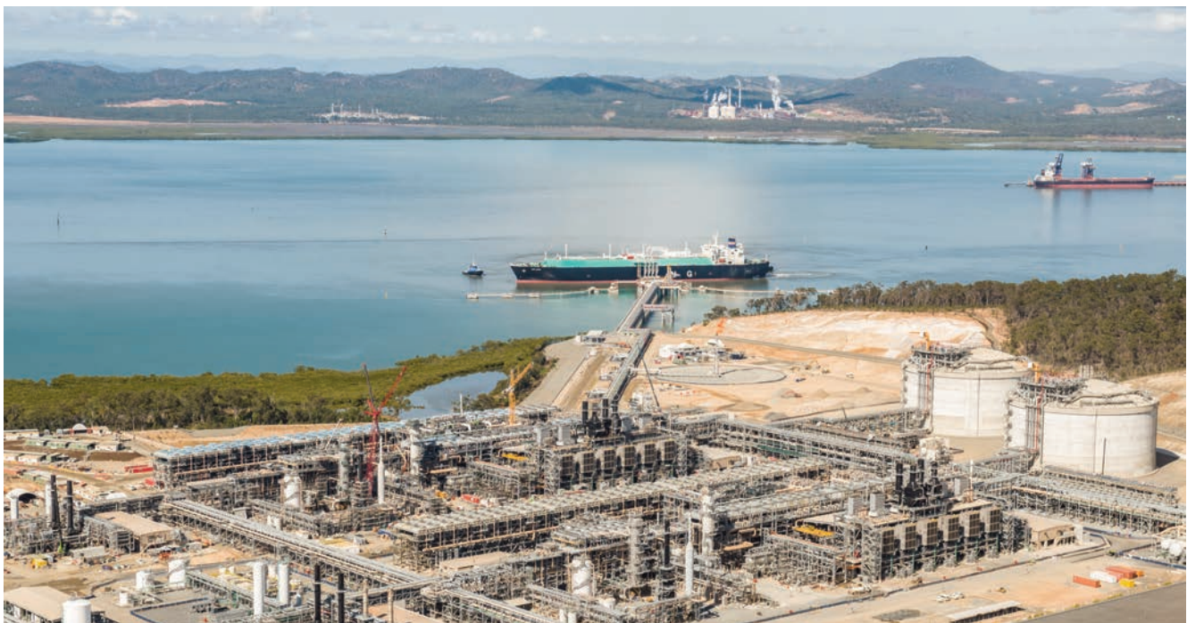
Gladstone liquefaction terminal, Australia

Moreover, all the options granted to the Chairman and Chief Executive Officer were contingent upon performance conditions. As regards the other beneficiaries, all the options granted by the Board on September 14, 2011 were also contingent upon performance conditions. Of the share subscription options granted on September 14, 2010, those above a certain threshold were contingent upon performance conditions.