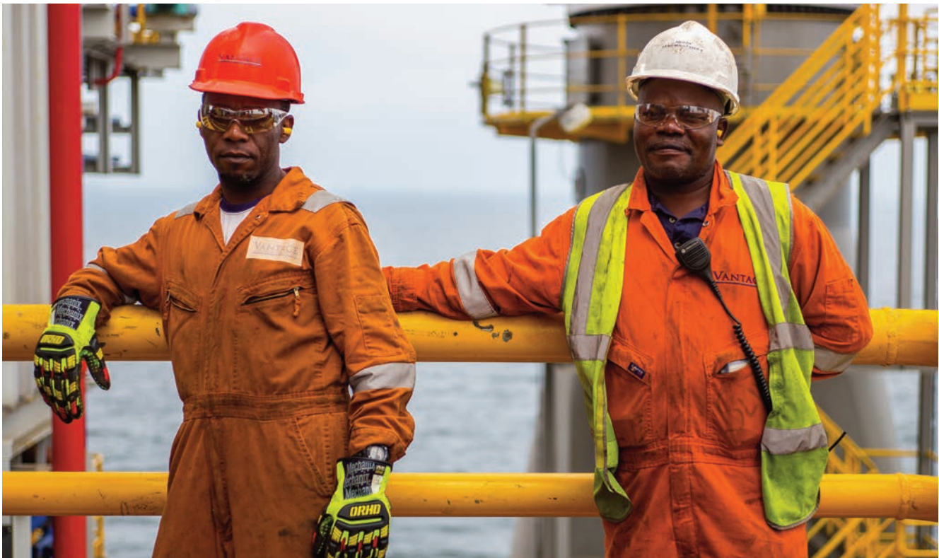
Moho Nord project, Congo.

_ 61% of rights were exercised, i.e. 24,752,821 new shares were issued with share price set at €36.24 for the third interim dividend for the 2015 fiscal year.