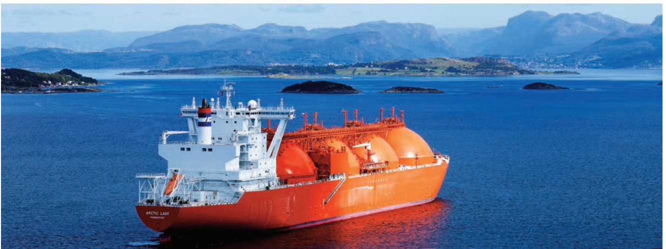
Liquefied natural gas carrier Arctic Lady off Norway.

The strategy implemented by the Group in 2015 based on its four priorities of Safety, Delivery, Costs and Cash, will continue in 2016, notably for the benefit of its shareholders.