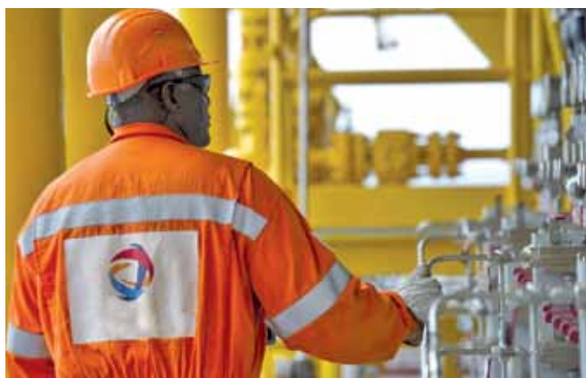
Platform, off Port Gentil, Gabon.