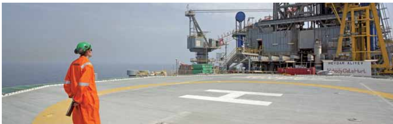
Absheron platform, Baku, Azerbaijan.

The options granted on the basis of this authorization may not grant the right to subscribe or purchase a number of shares that exceeds 0.75% of the share capital as of the date that the Board decides to grant the options.