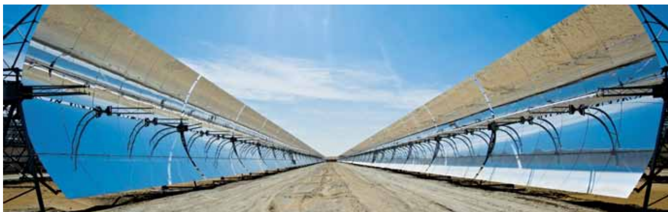
Solar power plants in Madinat Zayed, United Arab Emirates.