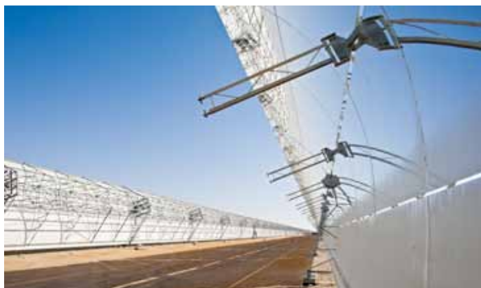
Solar power plant in Madinat Zayed, United Arab Emirates.