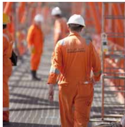
Field of Kashagan, Kazakhstan.