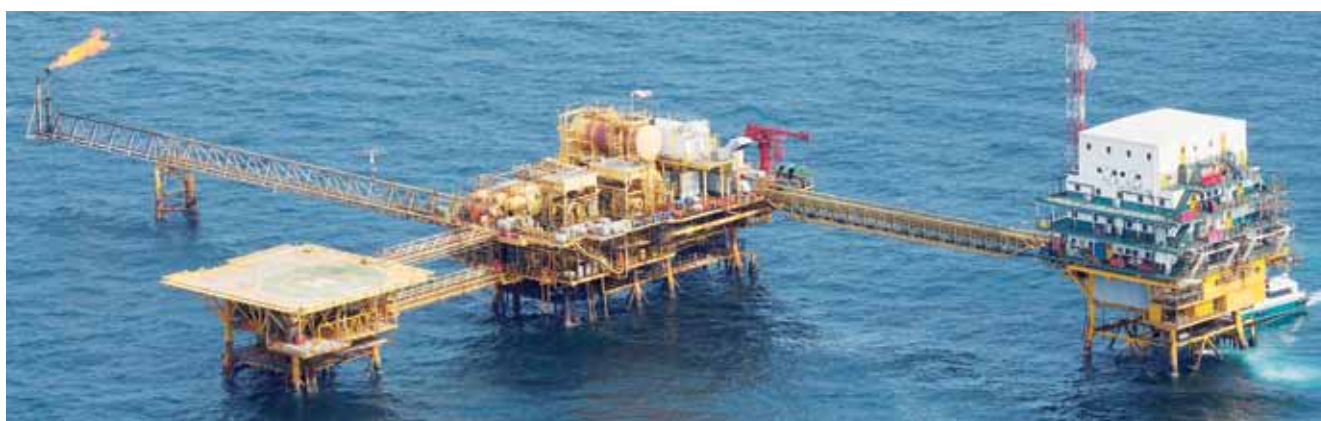
Platform of Port Gentil, Gabon.

The ex-dividend date for the remainder of the 2012 dividend would be June 24, 2013; for the ADR (NYSE:TOT) the ex-dividend date would be June 19, 2013.