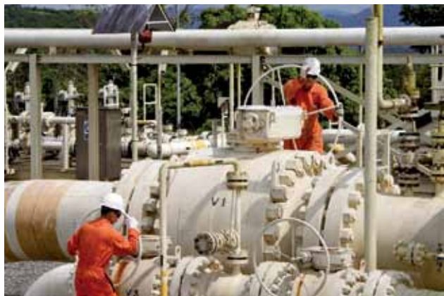
Gas processing plant, Myanmar.