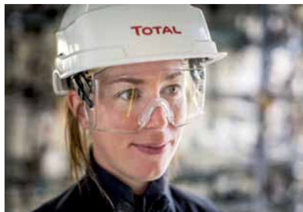
Normandy refinery, France.