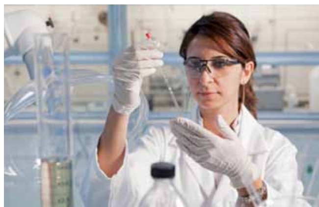
Research center in Doha, Qatar.