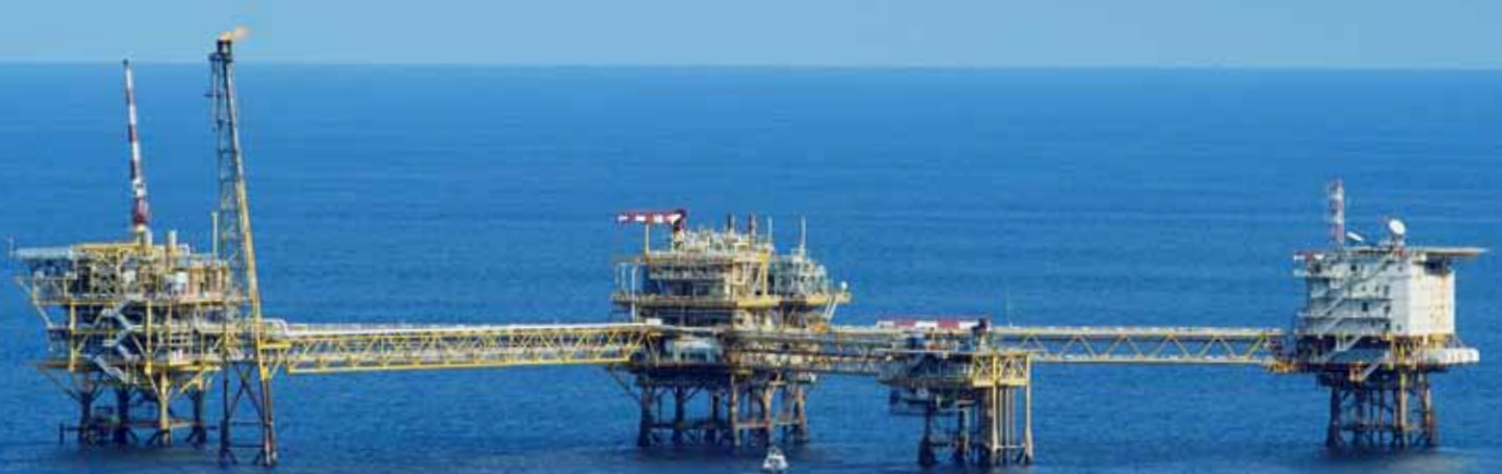
Yadana platform, Myanmar.

TOTAL is one of the largest integrated oil and gas companies in the world, with activities in more than 130 countries.