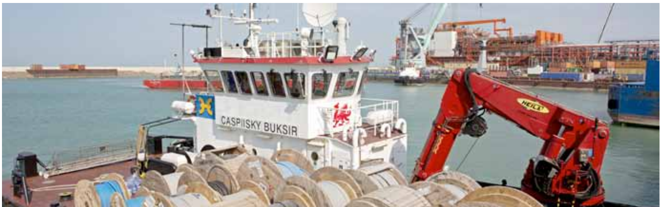
Field of Kashagan, Kazakhstan.