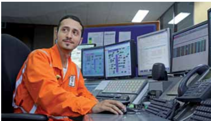
Qatargas plant, Qatar.

Your Board of Directors therefore proposes that you decide to set at 1,400,000 euros the annual maximum amount of directors’ fees allocated to the Board of Directors for fiscal year 2013. If approved, this decision shall be maintained and that same global amount shall be allowed to the Board of Directors for subsequent fiscal years, until the Shareholders’ Meeting adopts another decision. This decision shall supersede the decision issued by the Shareholders’ Meeting on May 11, 2007, which set the maximum annual amount of directors’ fees at €1,100,000, which has not been reassessed.