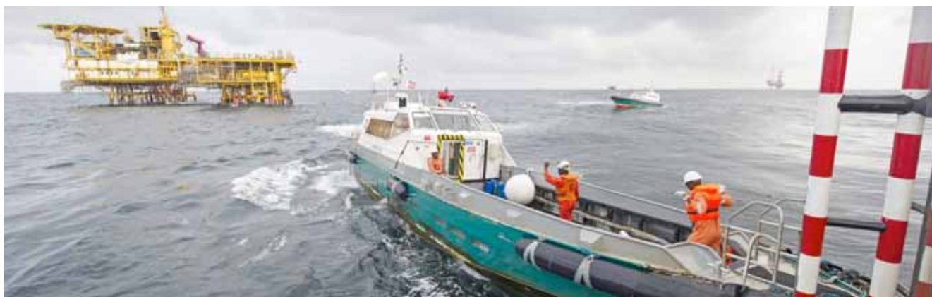
Platform off Port Gentil, Gabon.