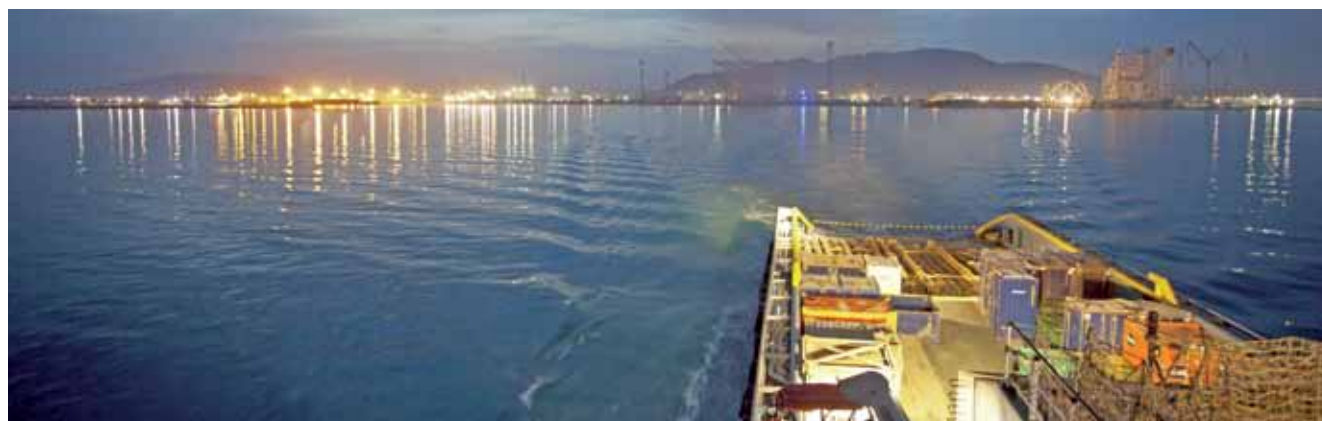
Port of Baku, Azerbaijan.

Pursuant to the provisions of Article L. 225-209 of the French Commercial Code, the maximum number of shares that can