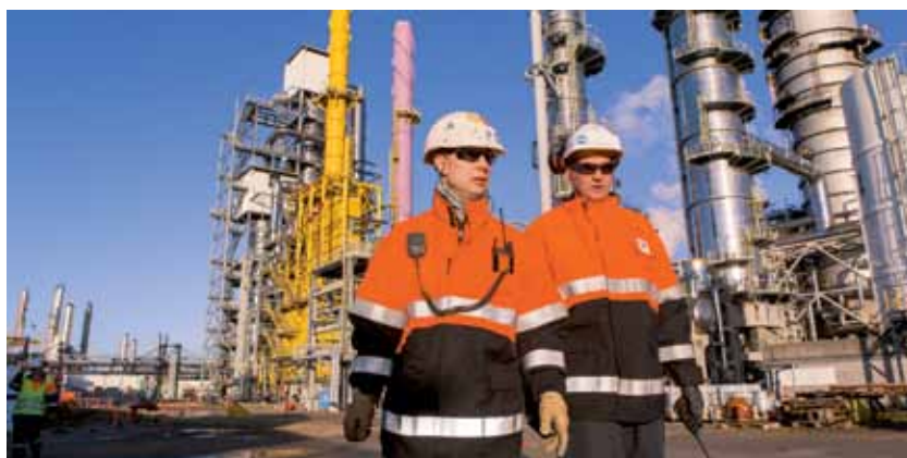
Petrochemicals plant of Gonfreville-Lorcher, France.

The performance condition applicable to options that, in the applicable circumstance, could potentially be granted to other beneficiaries in 2013 shall provide that the final number of options granted shall be a function of the average Return on Equity (ROE) for fiscal years 2013 through 2015.