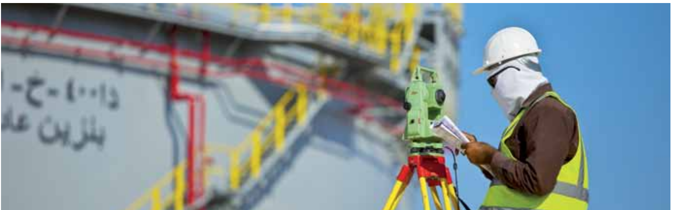
Jubail refinery, Saudi Arabia.