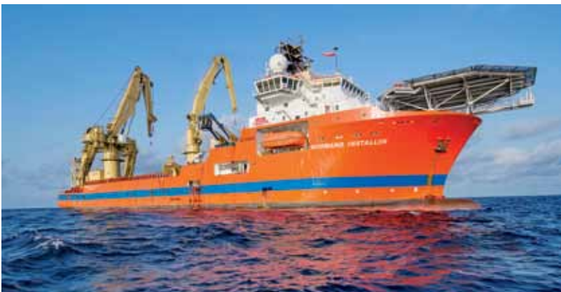
The Normand Installer boat, off Lobito, Angola.

Freedom of expression within the company promotes progress and that is true in every area, including technical and ethical areas. An oil company with professionals at the international level that deals with technical and scientific issues at the cutting edge of available technologies, cannot tolerate self-regulation by its employees with respect to both ethical issues and technical issues, which might be motivated by the fear of reprisals or displeasing those who think otherwise, at the risk of losing opportunities or making errors of judgment and assessment that could at times be tragic for the TOTAL Group, which has a presence in countries where there may be corruption and which is often exposed to complex situations and pressures. It must have a strong, independent, and credible Ethics Committee, which all employees or executives may look to in complete confidence and without fear.