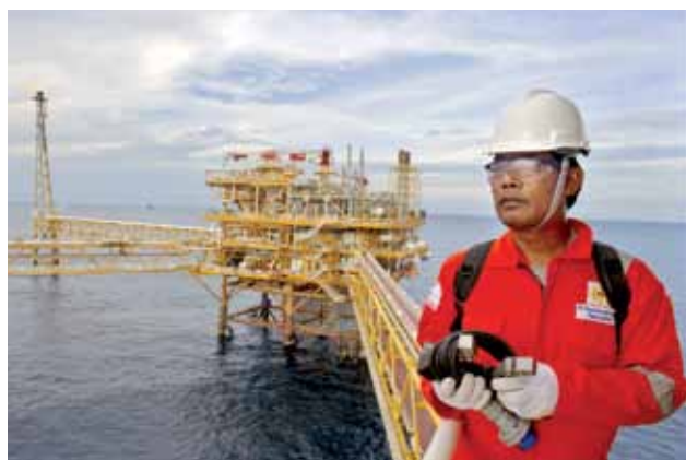
Yadana platform, Myanmar.

kets Authority ( Autorité des marchés financiers , or "AMF"), and voting under the conditions of quorum and majority required for Ordinary General Meetings, the shareholders hereby authorize the Board of Directors, with the possibility to sub-delegate such authority under the terms provided for by law, pursuant to the provisions of Article L. 225-209 of the French Commercial Code, of Council Regulation n°2273/2003 dated December 22, 2003 and of the General Regulation of the AMF, to buy or sell