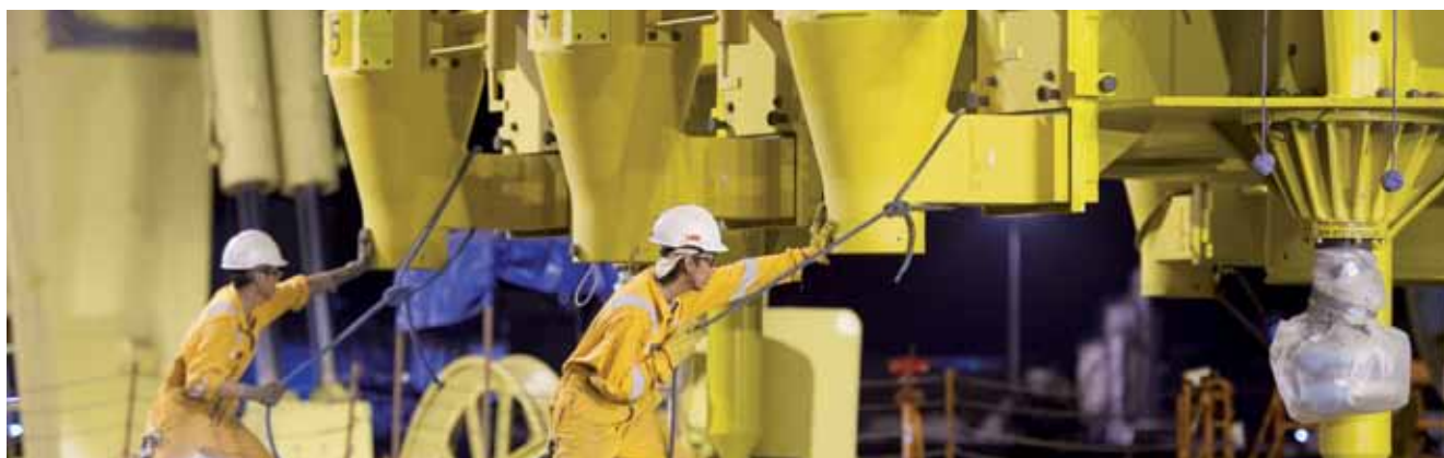
Sonamet yard, Lobito, Angola.