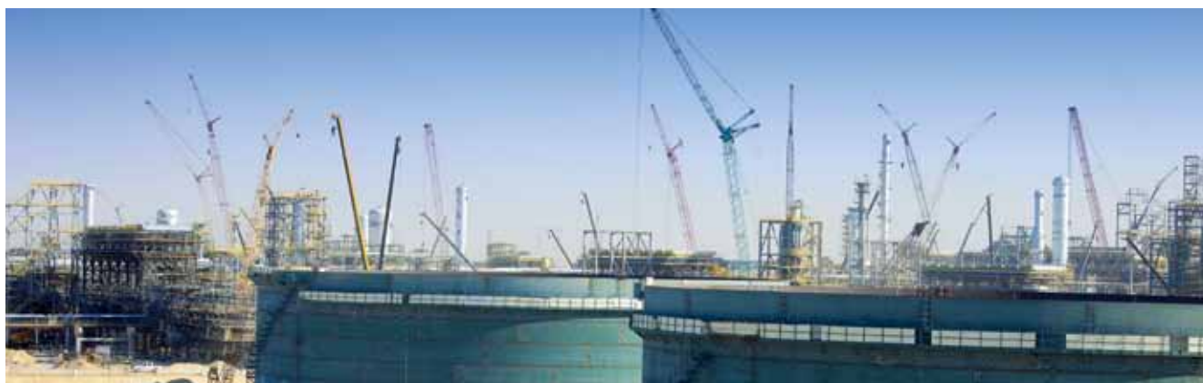
Jubail refinery, Saudi Arabia.

This delegation of authority shall be granted for a period of twenty-six months following this Shareholders' Meeting.