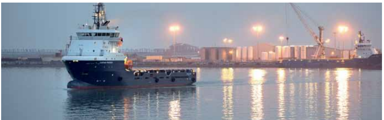
Transport boat off to Absheron platform, Baku, Azerbaijan.

As a consequence, the Board of Directors decided not to approve this resolution.