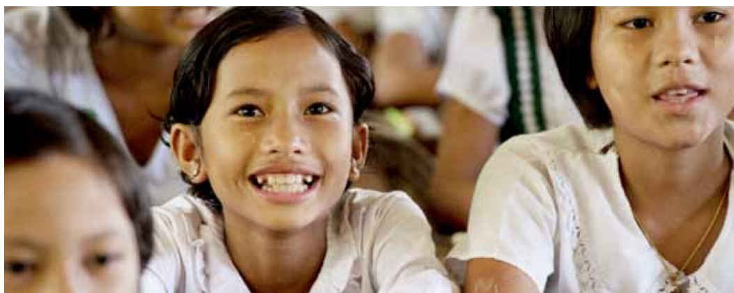
Pupils attending the "Yadana Tuition" schooling program, Myanmar.

The focus on indicators, especially if they prove not to be the most relevant, may distract attention from major industrial risks. Furthermore, linking economic or financial incentives to achieving security results may actually distort indicators and produce the opposite result by providing a sense of false security, as has been lucidly pointed out by OSHA (the Federal Occupational Safety and Health Administration in the US).