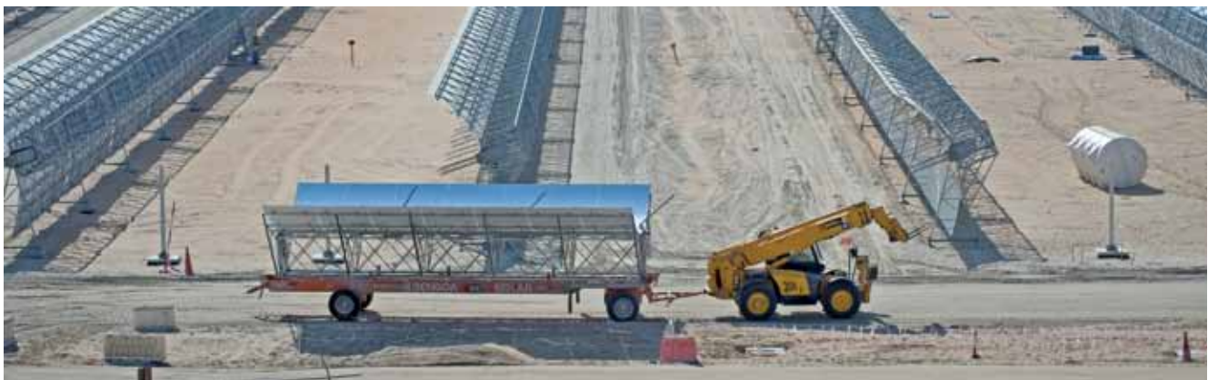
Solar power plant in Madinat Zayed, United Arab Emirates.

The Shareholders' Meeting may decide at any time, but only on the basis of a proposal by the Board of Directors, to effect a complete or partial distribution of the amounts appearing in the reserve accounts, either in cash or in Company shares.