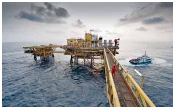
GRONDIN offshore site, off Port Gentil, Gabon.