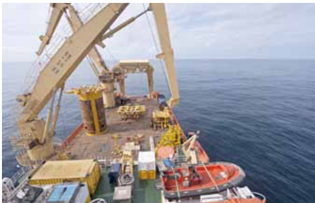
Normand Installer boat, off Lobito, Angola.