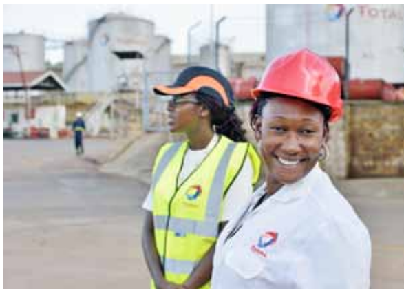
Petroleum products deposit of Kampala, Uganda.