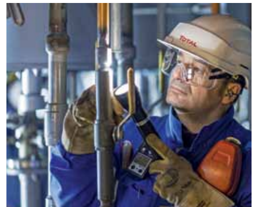
Normandy refinery in Harfleur, France.