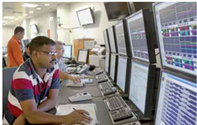
Treatment plant of Bolashak, Kazakhstan.